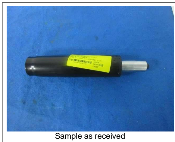
Sample as received

SGS authenticate the photo on original report only